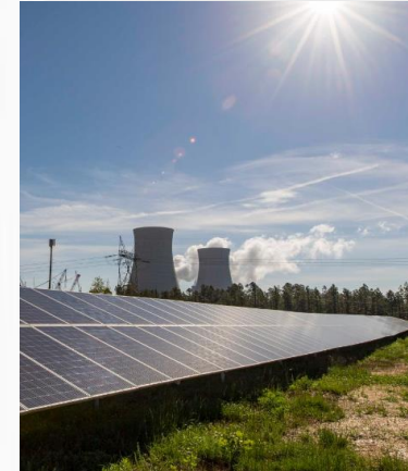
Generation Resource Adequacy and Fleet Diversity