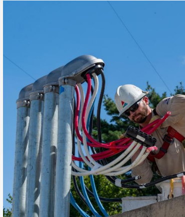
Distribution Planning and Infrastructure Investments