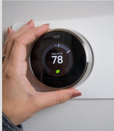
Electrical Load Forecasting