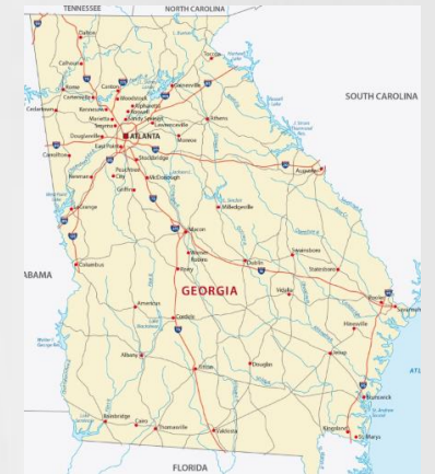
Market Structure and Governance