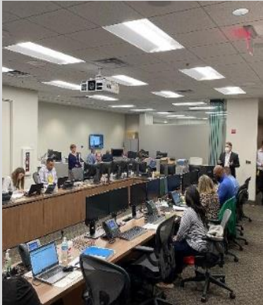
Utilities and Coordinated Operations and Coordinated Planning

At Georgia Power, we're continuously planning and making critical, essential investments to meet our customers' evolving needs today and for years to come.