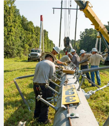
Transmission Planning and Infrastructure Investments