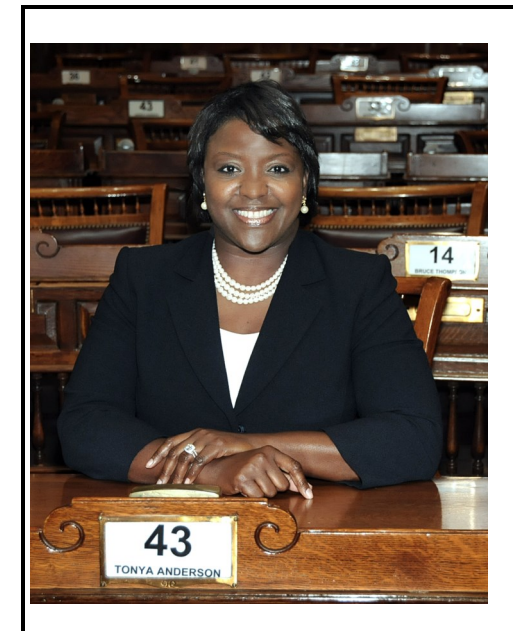
Senator Tonya P. Anderson Senate District 43