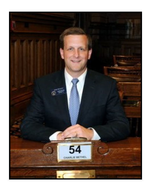
Senator Charlie Bethel Senate District 54