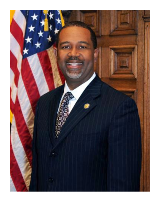
Senator Hardie Davis Senate District 22