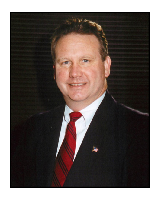
Senator Tim Golden Senate District 8