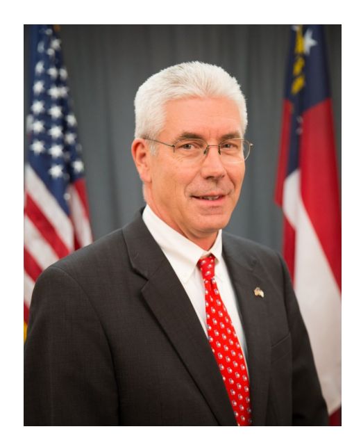
Senator Bill Heath Senate District 31