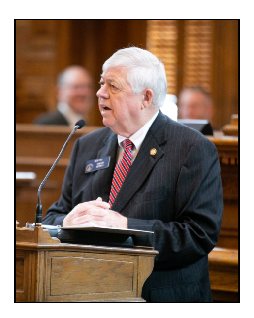
Senator Jack Hill Senate District 4