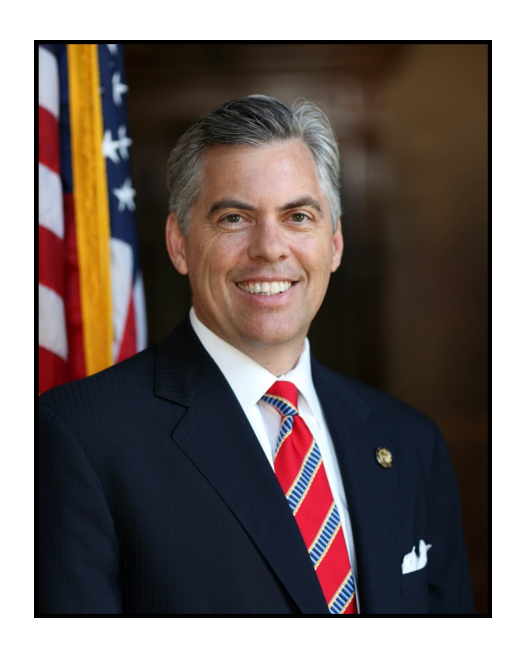
Senator Judson Hill Senate District 32