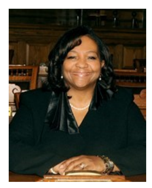
Senator Donzella James Senate District 35