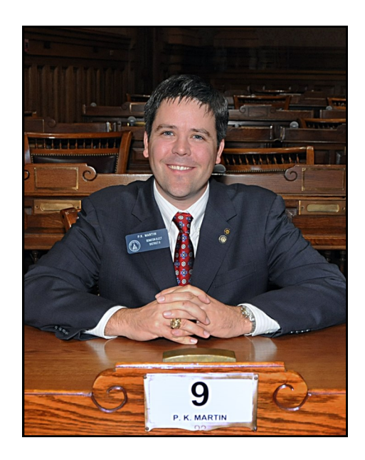
Senator P.K. Martin Senate District 9