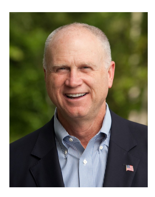
Senator Butch Miller Senate District 49