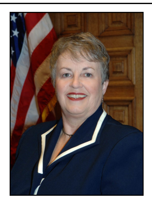
Senator Nan Orrock Senate District 36