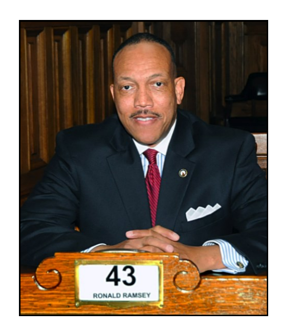
Senator Ronald Ramsey Senate District 43