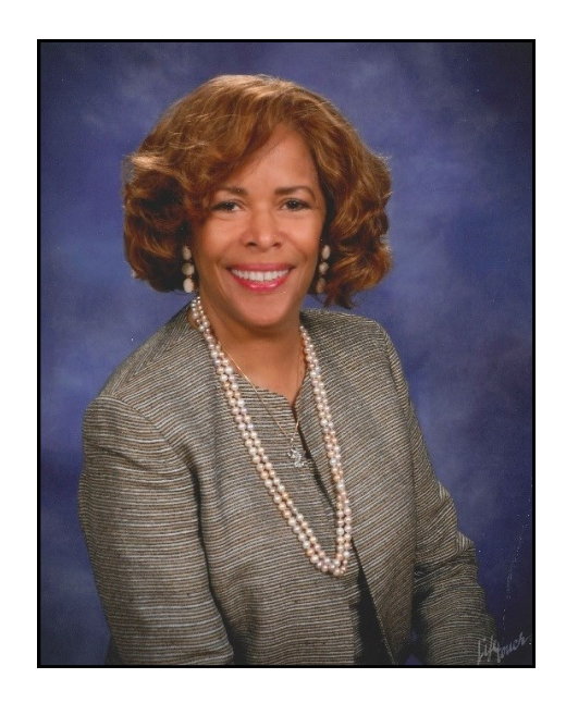
Senator Horacena Tate Senate District 38