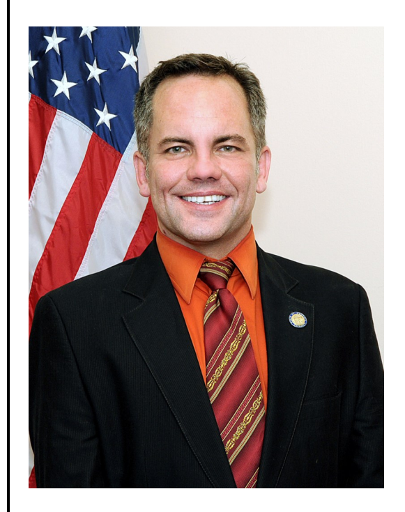
Senator Curt Thompson Senate District 5