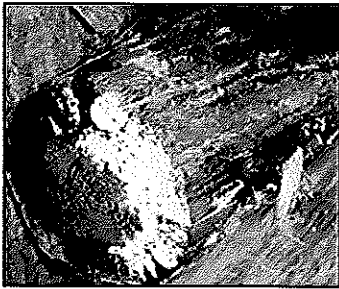
Mold growing outdoors on firewood. Molds come in many colors; both white and black molds are shown here.

Why is mold growing in my home? Molds are part of the